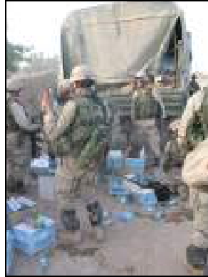
C/3-504 paratroopers quickly conduct hasty water resupply in Sangin, Afghanistan. Operation Resolute Strike, 8 April 2003