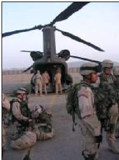
Paratroopers of C/3-504 prepare to load CH-47 Helicopters. Operation Resolute Strike, 8 April 2003