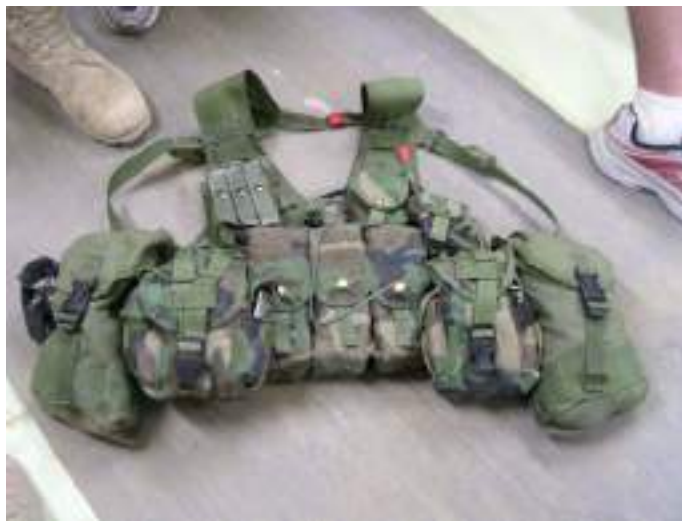
Figure B.1 MOLLE FLC modified as rack system

a. Fighting Load Carrier (FLC). Soldiers in general appreciate the FLC and its versatility. The FLC enables the individual Soldier to tailor his own load bearing equipment so that he has the appropriate MOLLE cargo pouches in areas that are most easily accessible to him. Many Soldiers prefer to wear the FLC's belt backwards so that they can use the reversed FLC belt as a rack system in their front for MOLLE magazine pouches. 2-504 PIR incorporated the backwards FLC belt as a battalion standard operating procedure (SOP). When the FLC is worn in this manner, however, the extraction handle on the FLC is pulled forward due to the weight on the front of the FLC and this nylon handle digs into the back of a Soldier's neck and creates considerable discomfort.