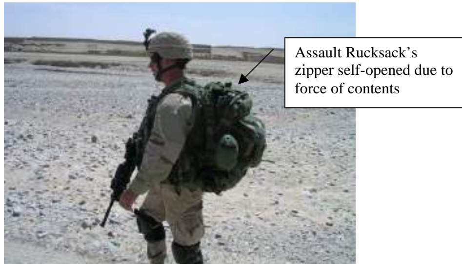
Figure B.2 Soldier's Assault Rucksack Zipper Has Self-Opened

(1) Assault Rucksack volume is too small. The MOLLE Assault Rucksack, even with two accessory pouches is far too small and awkward in design for adequately carrying the Infantryman's Approach March Load. The zippered top to the Assault Rucksack is extremely cumbersome to close when the pack is filled and the zipper tends to self-open when the pack is very full. Soldiers and units much prefer commercial assault rucksacks and the London Bridge rucksack was used by all troopers in 2-504 Parachute Infantry.